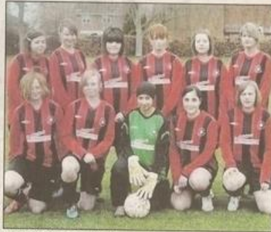
The Bucks CC girls side gather for a team photograph.

Girls can play from seven years upwards and the league is geographically split into the South and North so travelling is minimised. This season will see the return of monthly development festivals at Fairford Leys where beginners aged seven to 11 years can come