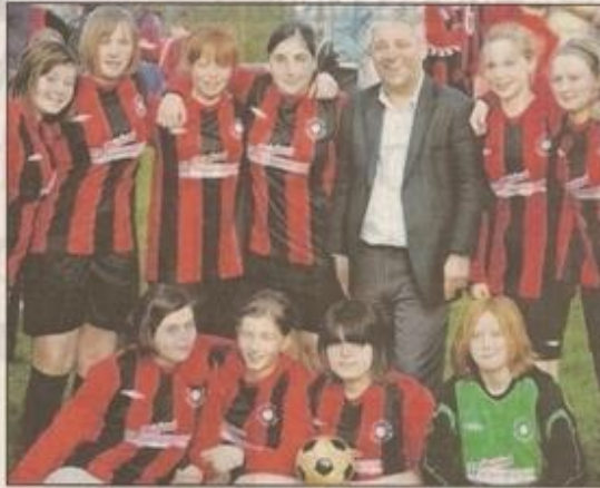
Bucks CC Girls with special guest, Speaker John Bercow

BUCKS CC Girls came out on top at the Buckingham Town International Twinning Tournament over the weekend winning the Plate competition in a penalty shoot out against the German side Neukirchen-Vluyn.